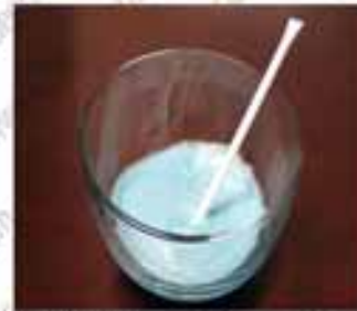
Step 3: Mix