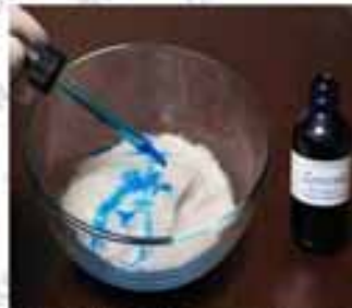
Step 2: Add Extract