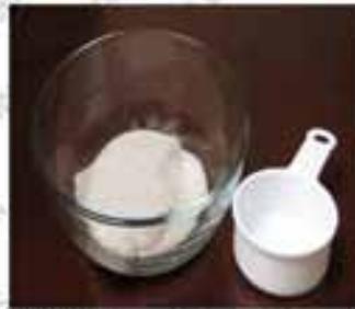
Step 1: Scoop